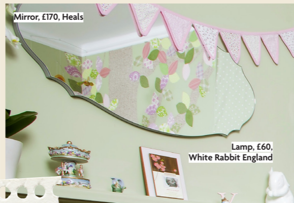
Mirror, £170, Heals

'It was important to keep the original features of the house like these gorgeous tiles'