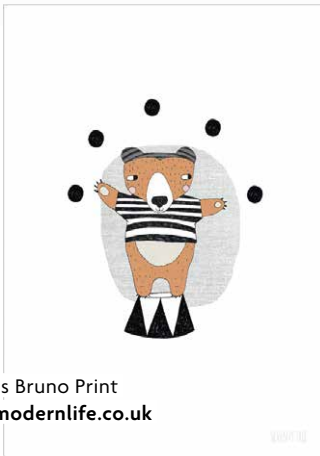
Circus Bruno Print £15, thismodernlife.co.uk