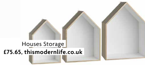
Houses Storage £75.65, thismodernlife.co.uk

Mix and match products to create the perfect colour palette for your baby's cot