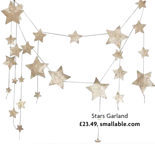
Stars Garland £23.49, smallable.com