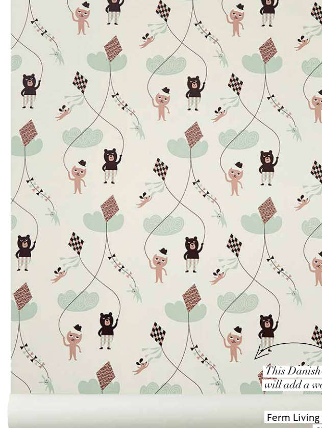
This Danish-designed graphic print will add a wonderfully nostalgic feel