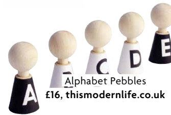
Alphabet Pebbles £16, thismodernlife.co.uk