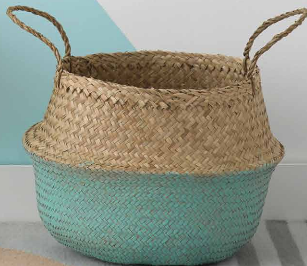
World Map Poster, £25, Mint Dipped Belly Basket, £29, Nema Kilim Rug, £139, olliella.com