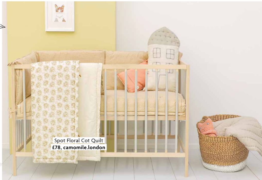
Spot Floral Cot Quilt £78, camomile.london

Mix and match products to create the perfect colour palette for your baby's cot