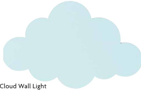
Cloud Wall Light £64, thismodernlife.co.uk