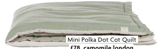
Mini Polka Dot Cot Quilt £78, camomile.london