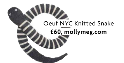
Oeuf NYC Knitted Snake £60, mollymeg.com