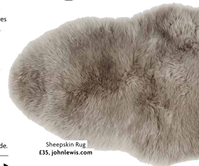
Sheepskin Rug £35, johnlewis.com

T here are many good reasons to go for a gender-neutral style when decorating your baby's nursery: you might not want to know the sex until the birth; you might have a girl and a boy sharing a room; or you might want to avoid gender stereotyping on more philosophical grounds. Whatever your reason, here are some tips for beautiful gender-neutral decorating: