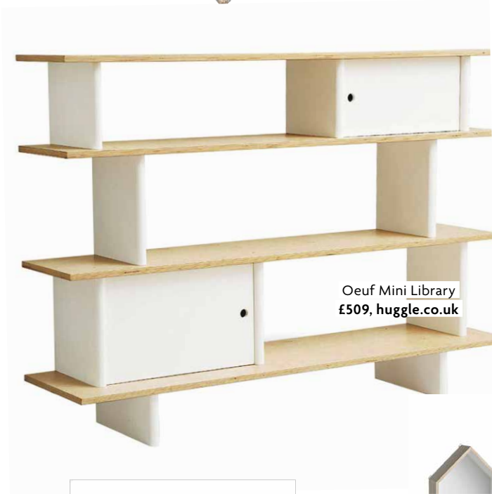
Oeuf Mini Library £509, huggle.co.uk