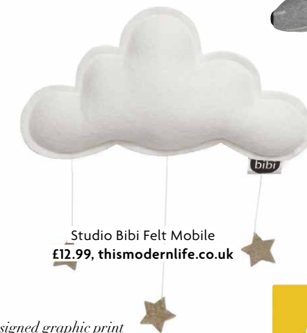
Studio Bibi Felt Mobile £12.99, thismodernlife.co.uk