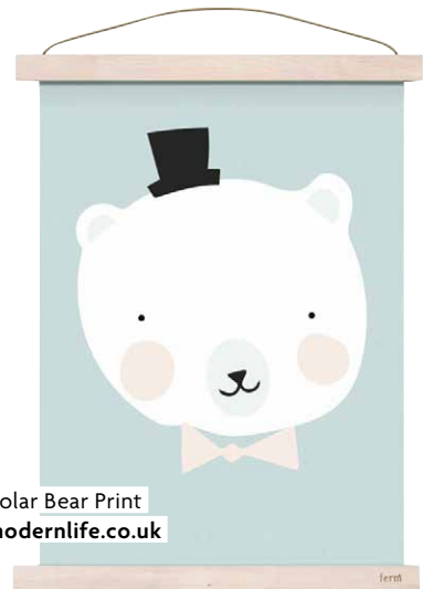
Mister Polar Bear Print £12, thismodernlife.co.uk