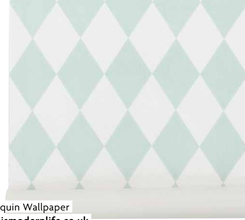
Harlequin Wallpaper £59.95, thismodernlife.co.uk