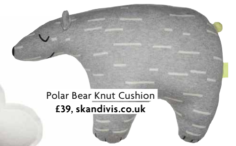
Polar Bear Knit Cushion £39, skandivis.co.uk