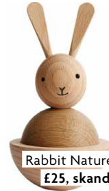
Rabbit Nature Decoration £25, skandivis.co.uk