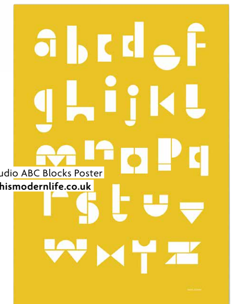
Snug Studio ABC Blocks Poster £19, thismodernlife.co.uk