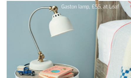
Gaston lamp, £55, at Loaf