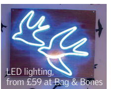
LED lighting, from £59 at Bag & Bones