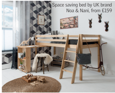
Space saving bed by UK brand Noa & Nani, from £159