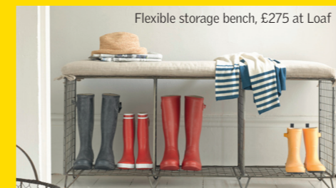
Flexible storage bench, £275 at Loaf

artisanal look at newcomer Dilli Grey, where pom-pom-fringed cushions are hand-blocked in India. Shop accessories at Mini Maison, where owner Joanna Riding has corralled her pick of 'accessible, modern décor': star night lights, cloud rugs and decorative paper storage bags adorned with flamingoes or pineapples. Let your children take their pick.