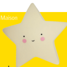
Star LED night light, £10, Mini Maison