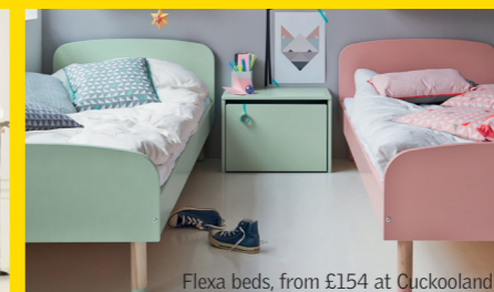
Flexa beds, from £154 at Cuckooland