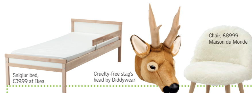
Sniglar bed, £3999 at Ikea