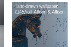
Hand-drawn wallpaper, £145/roll, Allison & Allison