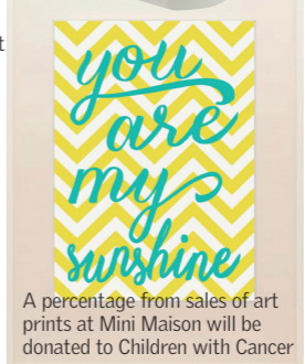
A percentage from sales of art prints at Mini Maison will be donated to Children with Cancer

one's coat or bath towel become part of the décor,' (or try Chocolate Creative). For art with a conscience, Mini Maison will be donating a percentage of profits from sales of their graphic art prints to Children with Cancer.