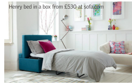
Henry bed in a box from £530 at sofa.com