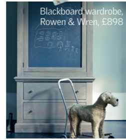
Blackboard wardrobe, Rowen & Wren, £898