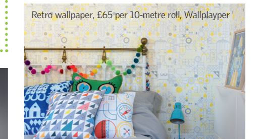
Retro wallpaper, £65 per 10-metre roll, Wallplayer