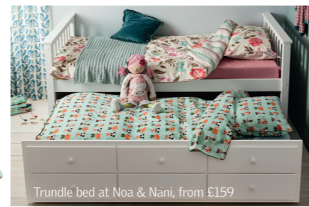
Trundle bed at Noa & Nani, from £159