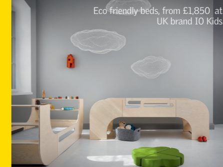
Eco friendly beds, from £1,850 at UK brand IO Kids